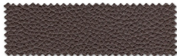
VINTAGE TESTA DI MORO