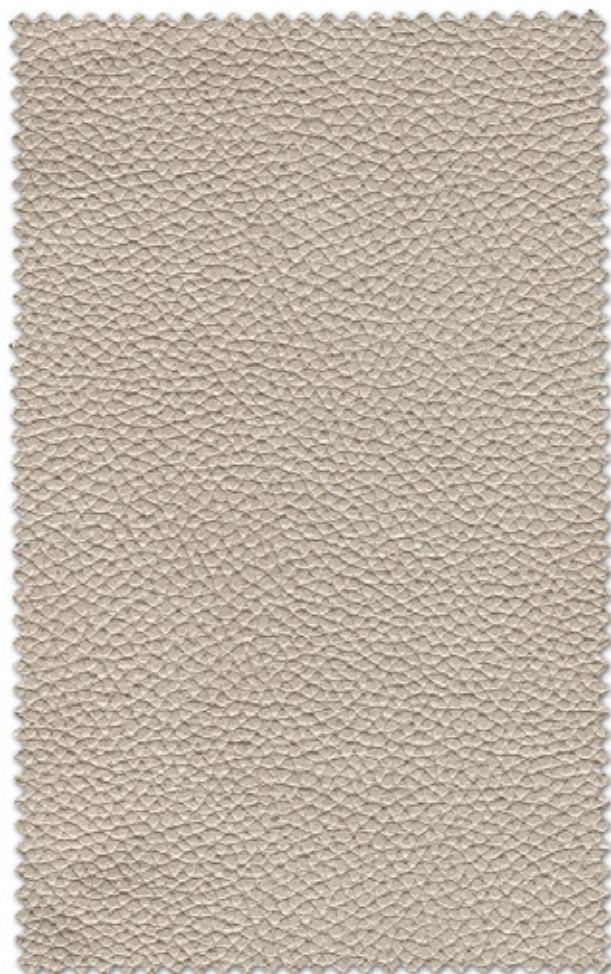
VINTAGE LIGHT GREY